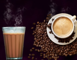
TEA & COFFEE