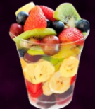
LASSI & FRUIT SALAD