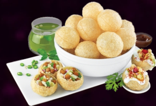
PANI PURI, MASALA PURI