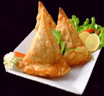
PAV BAJI, VADA PAV, SAMOSA