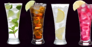
SODA , SOFTDRINKS